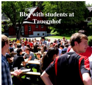
Bbq with students at Tauernhof