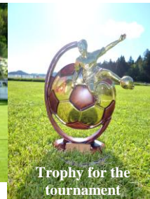
Trophy for the tournament