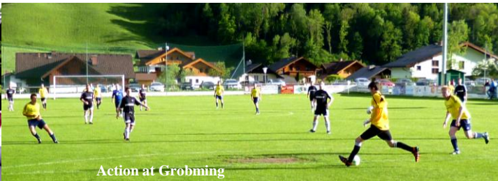
Action at Grobming