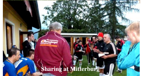
Sharing at Mitterburg