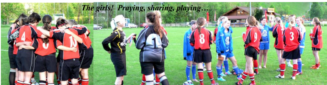
The girls! Praying, sharing, playing...