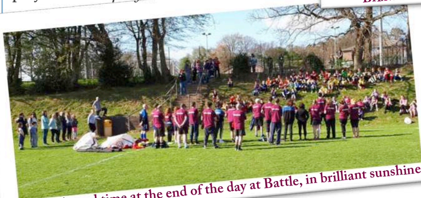
Coaches' Award time at the end of the day at Battle, in brilliant sunshine!

Please continue to pray for soccer and netball schools, and for the preparation for the leagues starting in September