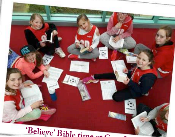
'Believe' Bible time at Carnforth

In amongst all of this, we also had football cup finals and league meal and the netball league cup, followed by tours to Austria and France. I hope you are encouraged as you read the reports of what God continues to do as an answer to your prayers. Please pray on!