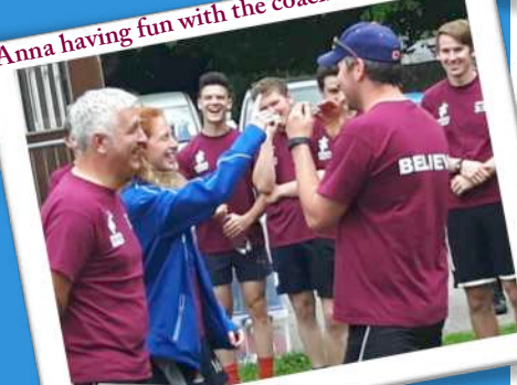
Battle senior red team