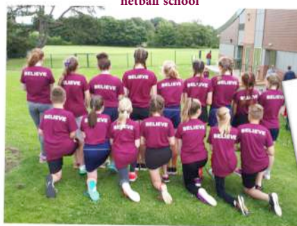
Mission field for a day!