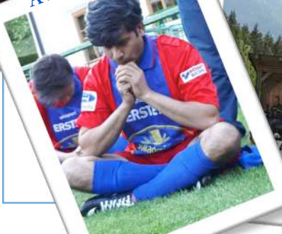
A refugee praying