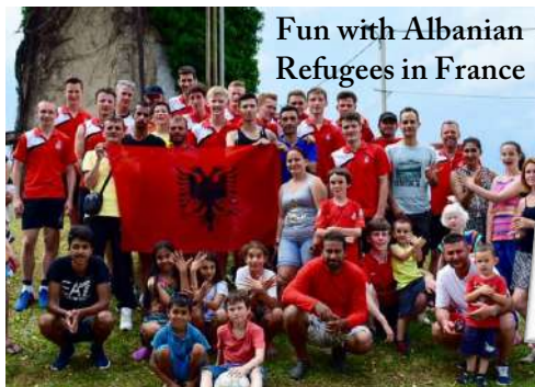
Fun with Albanian Refugees in France