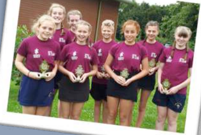
Junior winners Quernmore Comets