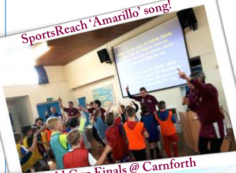
World Cup Finals @ Carnforth