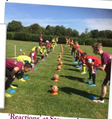
'Reactions' at Stowmarket