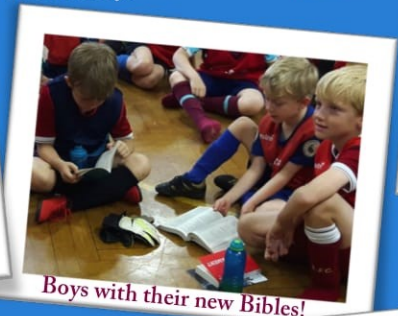
Boys with their new Bibles!