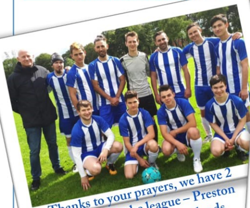
Thanks to your prayers, we have 2 new teams in the league – Preston City Mission and Moorlands