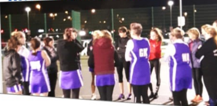
Roses and Harriers share the Word