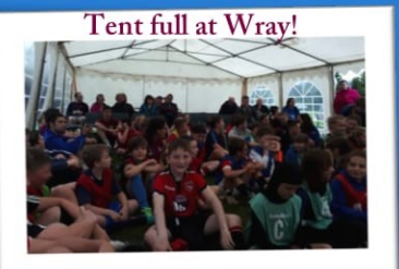
Tent full at Wray!

"Such a wonderful blessed week. We thank the Lord so much for SportsReach and for you all."