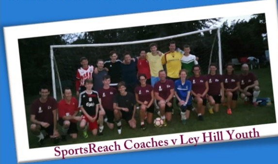
SportsReach Coaches v Ley Hill Youth

"My daughter has absolutely loved it! She has been so well behaved at home this week and has been getting up early and getting her stuff ready each day. Normally she drops out of things but has been keen to come every day."