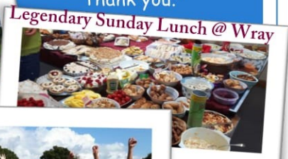
Legendary Sunday Lunch @ Wray