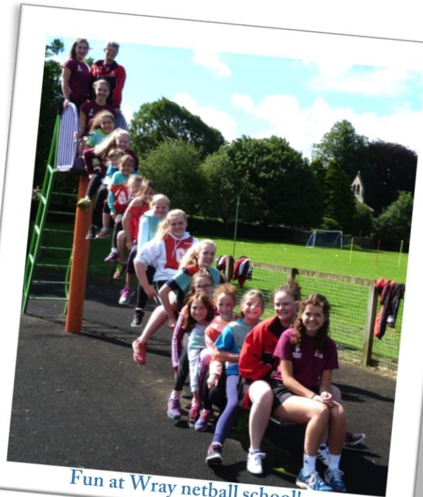
Fun at Wray netball school!