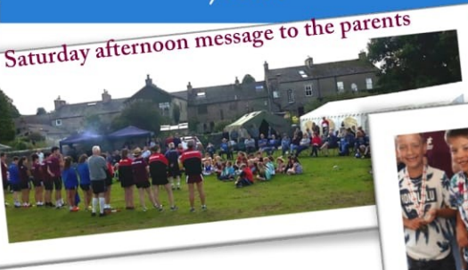
Saturday afternoon message to the parents