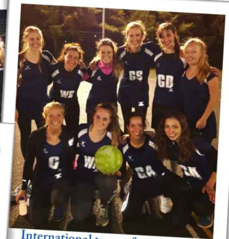
International team of students from Capernwray Hall win their first match!