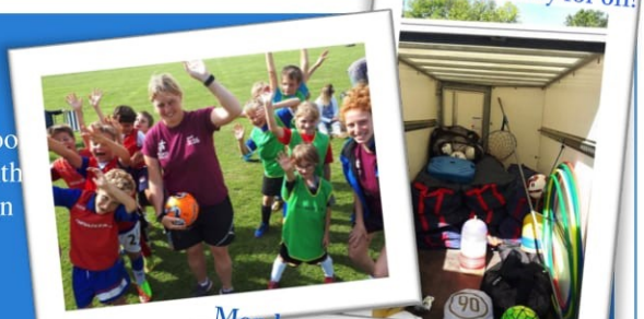
Equipment ready for off!

One of many highlights from the summer was Ripon soccer & netball school. God had given the fellowship a clear vision to go out and reach the local community with the Good News of Jesus, and to run a soccer and netball school. The faith of the folks was so evident, even when numbers were as low as 5 with only a week to go. They set aside special time to pray for more children to sign up, as well as going out into the streets to bring the children in free of charge. God honoured them with 25 children coming along to the S&N School and many showing an interest in what it is to be a follower of Jesus. Fantastic to see God at work in the Church and in the community.