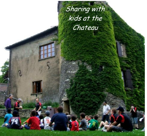
Sharing with kids at the Chateau