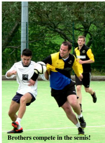
Brothers compete in the semis!

The Men's 5Aside Tournament was held again this year at Lancaster University, 29 th June. 11 teams entered; winners on the day were Ingleton, runners-up Valley. Great day, great weather, great message... great God! This has to be one of the best ways of reaching young men with the gospel.