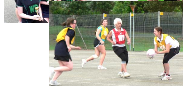
All-day action at the tournament