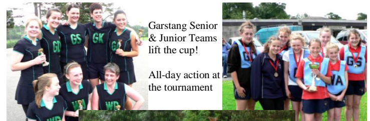
Garstang Senior & Junior Teams lift the cup!