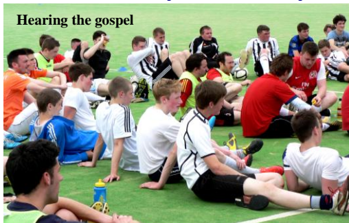
Hearing the gospel