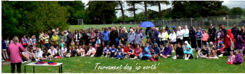
Tournament day 'up north'