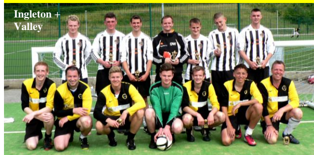
Ingleton + Valley

The Men's 5Aside Tournament was held again this year at Lancaster University, 29 th June. 11 teams entered; winners on the day were Ingleton, runners-up Valley. Great day, great weather, great message... great God! This has to be one of the best ways of reaching young men with the gospel.